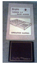
MGS Sargon 2.5