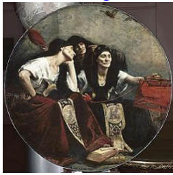
Alfred Agache: Les Parques , 1885