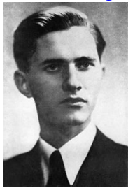
Paul Keres [4]